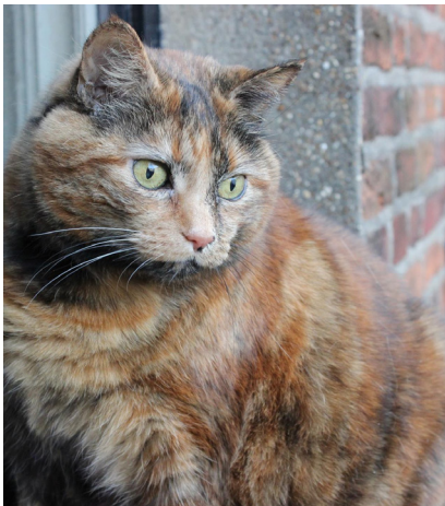
A good example

If you are having a painting done in colour, you need to make sure that the photograph gives a true representation of the animal's colouring. For example, a grey dog can look brown in a certain light. Don't use a flash, and take the picture in natural daylight if possible.